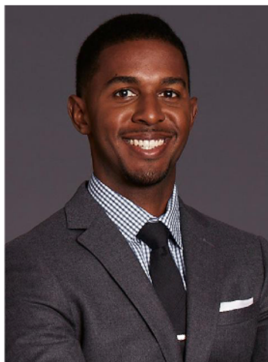
Resident 2014, Breast Fellow 2015

Q: Describe your career path that led you to NYU. Why did you decide to pursue a career in medicine, and specifically radiology?